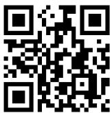
El Dorado County CodeRED Sign-Up